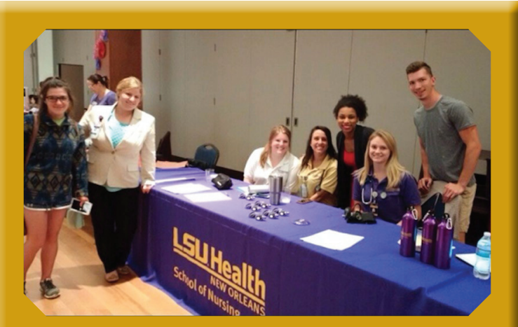
On April 14th, SNA volunteers attended UNO's Annual Health Fair. Volunteers provided blood pressure screenings and answered questions regarding our nursing programs.

SNA members volunteered with the Tulane Canal Neighborhood Association to pick up trash on Saturday, April 16th. Over 40 volunteers removed 1,000 tons of trash!