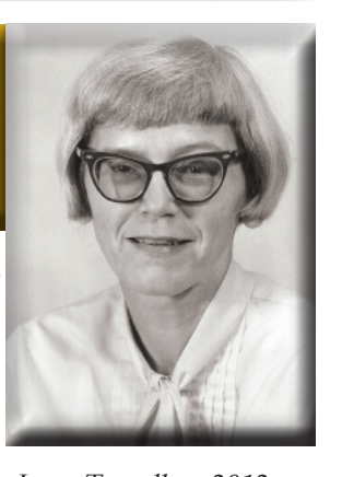
Joyce Travelbee, 2012 Hall of Fame Inductee