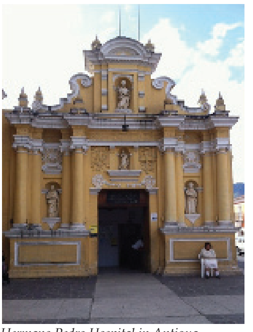
Hermano Pedro Hospital in Antigua, Guatamala

Amazingly, the hospital is staffed each week throughout the year with a different mission group volunteering to perform necessary surgeries for the people in the area. The patients not only include people native to Antigua, but also patients from all over Guatemala. Many patients must travel several hours to receive the medical or surgical treatment they are in such great need of.