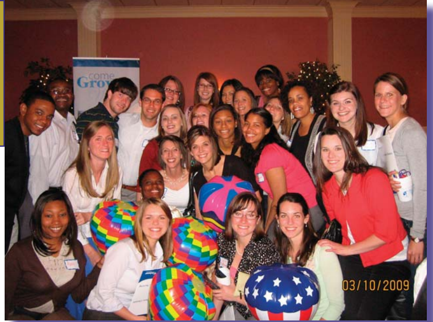
LSUHSC Students at a NODNAA Spring Event