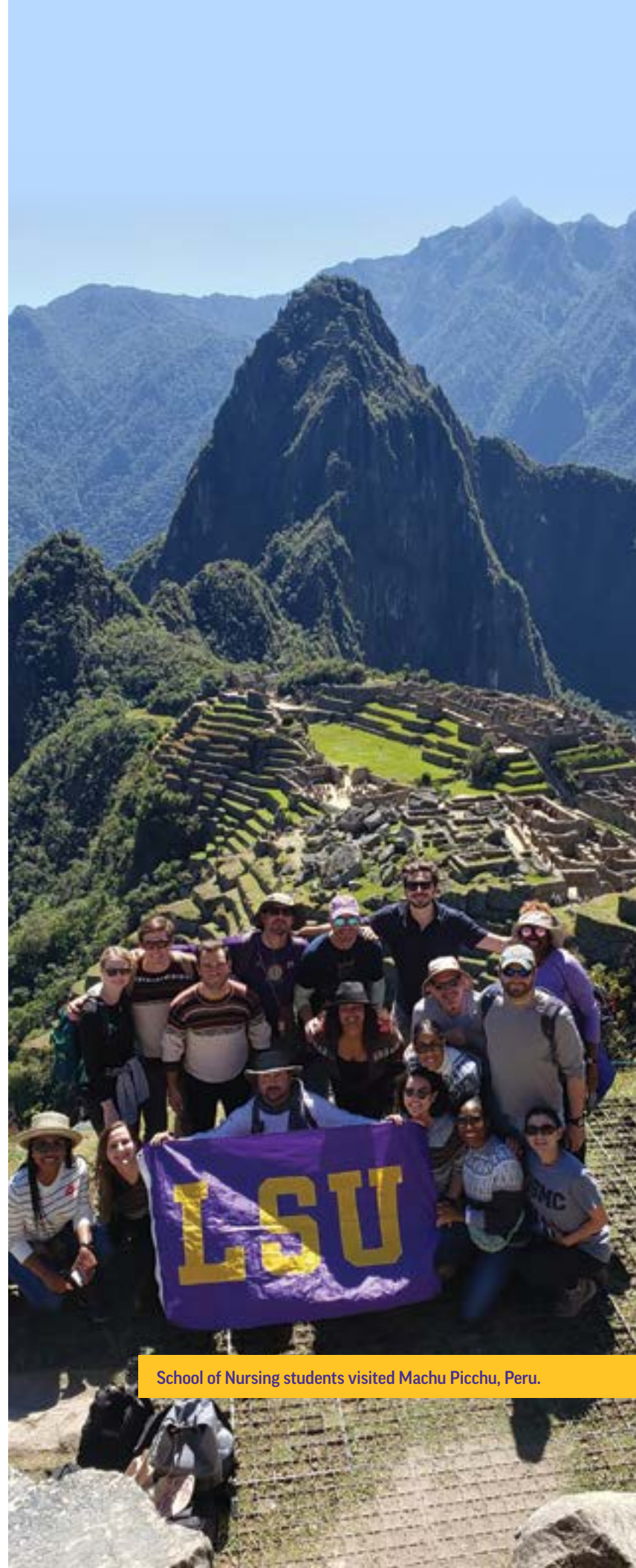
School of Nursing students visited Machu Picchu, Peru.

While there, they encountered people with chronic, untreated or poorly treated diseases, which made care complex. They also learned how to find ways to provide care with limited medical equipment and resources, building their own confidence and skills along the way.