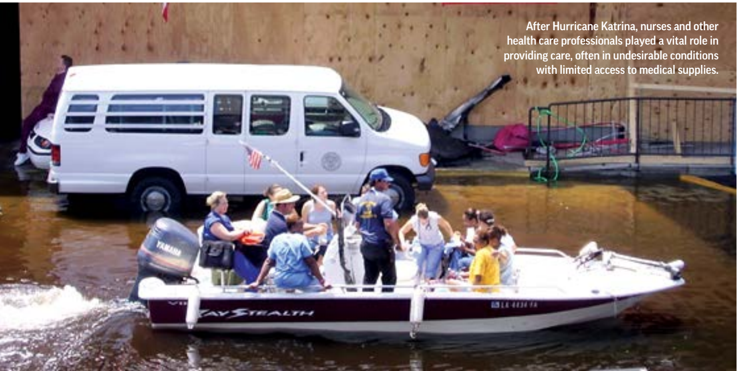
After Hurricane Katrina, nurses and other health care professionals played a vital role in providing care, often in undesirable conditions with limited access to medical supplies.

No one can predict when the next disaster will affect the United States – or what that disaster will look like. But in all likelihood, nurses will be among the first responders. Now because of a unique preparation program from LSU Health New Orleans School of Nursing, more than 1,500 RNs and nursing students nationwide are prepared to take on the challenge of disaster response.