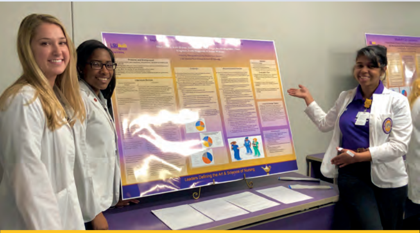
Senior II nursing students presented their Change Project posters on November 14.