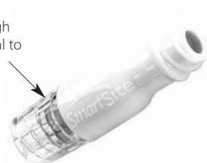
SmartSite® Positive Bolus Needle-Free Valve

Straight through fluid path equal to an 18 g needle