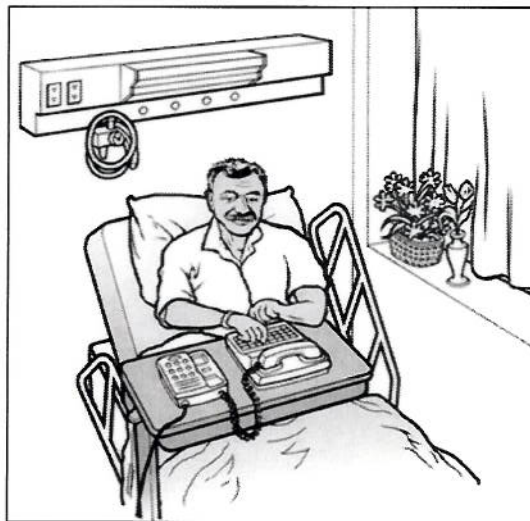
Image caption: A hospital patient uses a TTY in his hospital room.

The ADA established a free nationwide relay network to handle voice-to-TTY and TTY-to-voice calls. Individuals may use this network to call the hospital from a TTY. The relay consists of an operator with a TTY who receives the call from a TTY user and then places the call to the hospital. The caller types the message into the TTY and the operator relays the message by voice to the hospital staff person, listens to the staff person's response, and types the response back to the caller. The hospital must be prepared to make and receive relay system calls, which may take a little longer than voice calls. For outgoing calls to a TTY user, simply dial 7-1-1 to reach a relay operator.